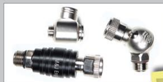
Extensive Gas Management Fittings