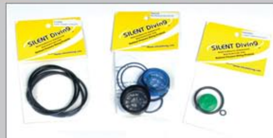
Complete Inventory of Inspiration & Evo Rebreather Parts in stock