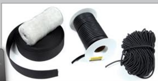
Webbing, Tubbing, & Shock Cord