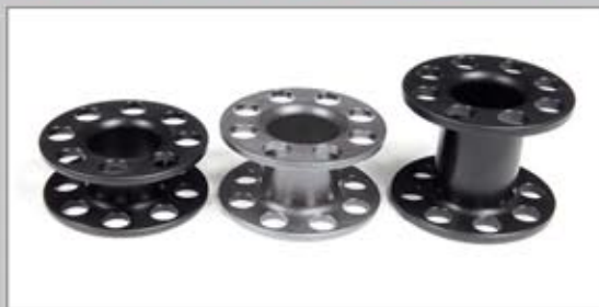
Custom Delrin or Aluminum Finger Spools